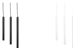
Black / Black